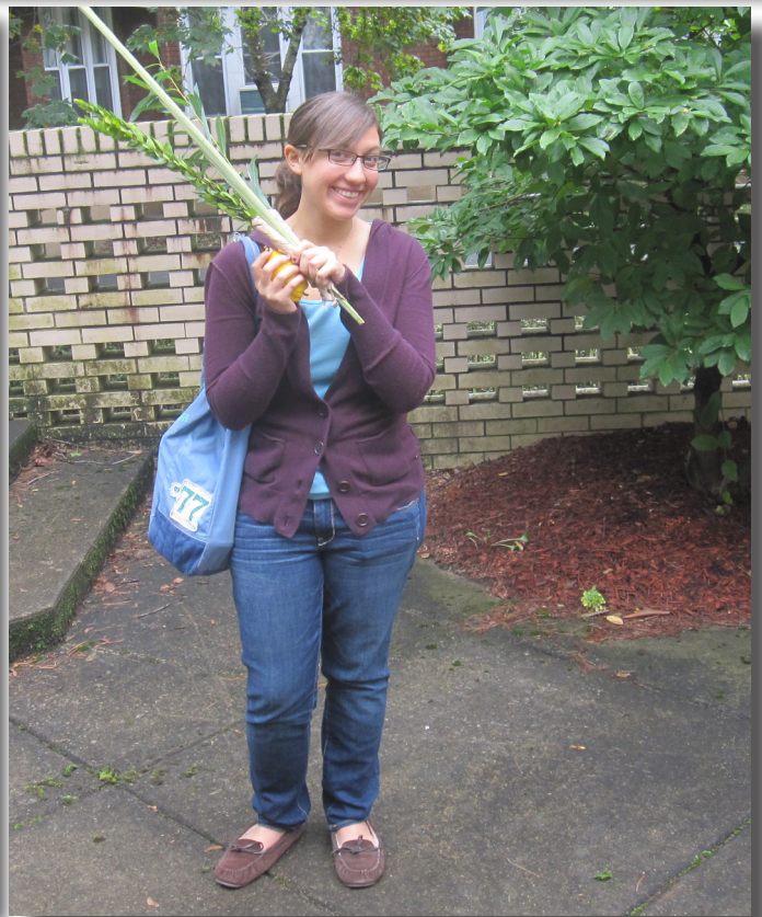
SUNDAY SCHOOL STUDENTS ENJOYING THE FESTIVAL OF SUKKOT